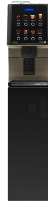
Base cabinet kit Ready to install a coin validator. (850 mm.)

It is also the perfect solution for a coffee service in convenience stores as well as for hotels, where breakfast needs to be good but also fast. It offers a pleasurable experience with an attractive, simple and functional design.