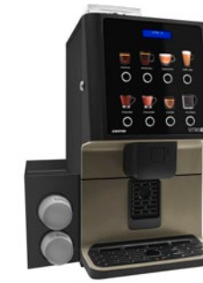
Cup module kit For dispensing cups.