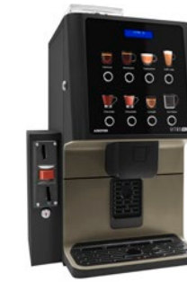
Validator module kit Ready to install a coin validator.