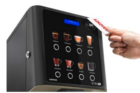
RFID Reader Kit For product recharge card or cashless systems