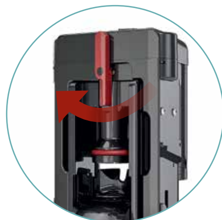
Patented, easy-to-replace brewing unit