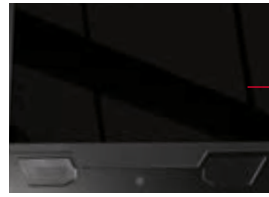
Modern and uncluttered design