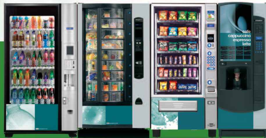
Image shows BevMax 4 35 select, Shopper 2, Merchant 4 & Evolution. Base graphics shown on Merchant and Evolution are available as extra cost options.

Place the Shopper 2 with snack, combination and drinks machines from the Crane Merchandising Systems range to create a total vending solution tailored to the needs of specific staff/customer preference or location.